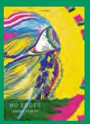
No Edges: Swahili Stories Various authors, translated by multiple translators

https://www.tiltedaxispress.com/store/i-belong-to-nowhere