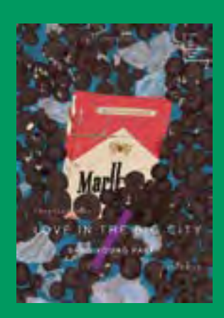
Love in the Big City Sang Young Park, translated by Anton Hur

https://www.tiltedaxispress.com/ store/no-edges