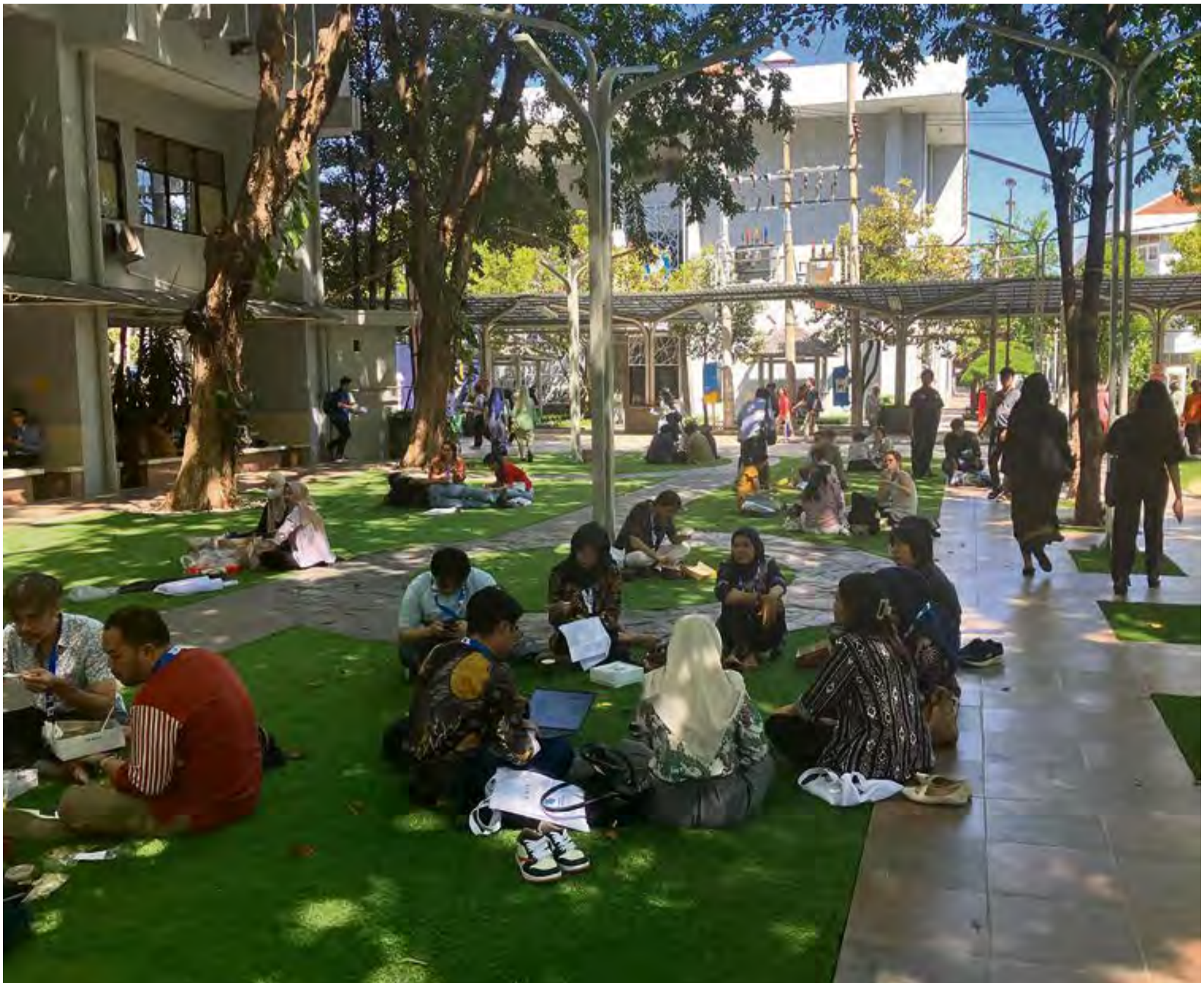
Fig. 5 (above): Participants enjoying lunch on the campus of Universitas Airlangga during ICAS 13.