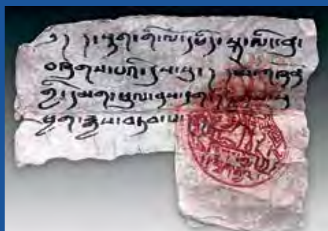
Fig. 2 (right). Military authorization paper with seals.