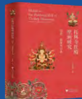
Fig. 2. Cover of A Study on the Murals of the Red Temple of Tholing Monastery: History, Images, and Texts by WANG Ruilei. (Zhejiang University Press, 2023)

Another breakthrough lies in the research on the Red Temple of Tholing Monastery. Constructed under the reign of the Guge King Khri nam mkha’i dbang po phun tshogs lde (1409-1481), the Red Temple constitutes the largest surviving Buddha hall from the Buddhist revival period of the Guge Kingdom in the 15th-16th centuries. Serving as an important ceremonial space for the royal family to worship, its murals reveal the early political and religious strategies of the Guge Kingdom, providing invaluable clues to the complex political and religious history of the middle-to-late Guge Kingdom. The