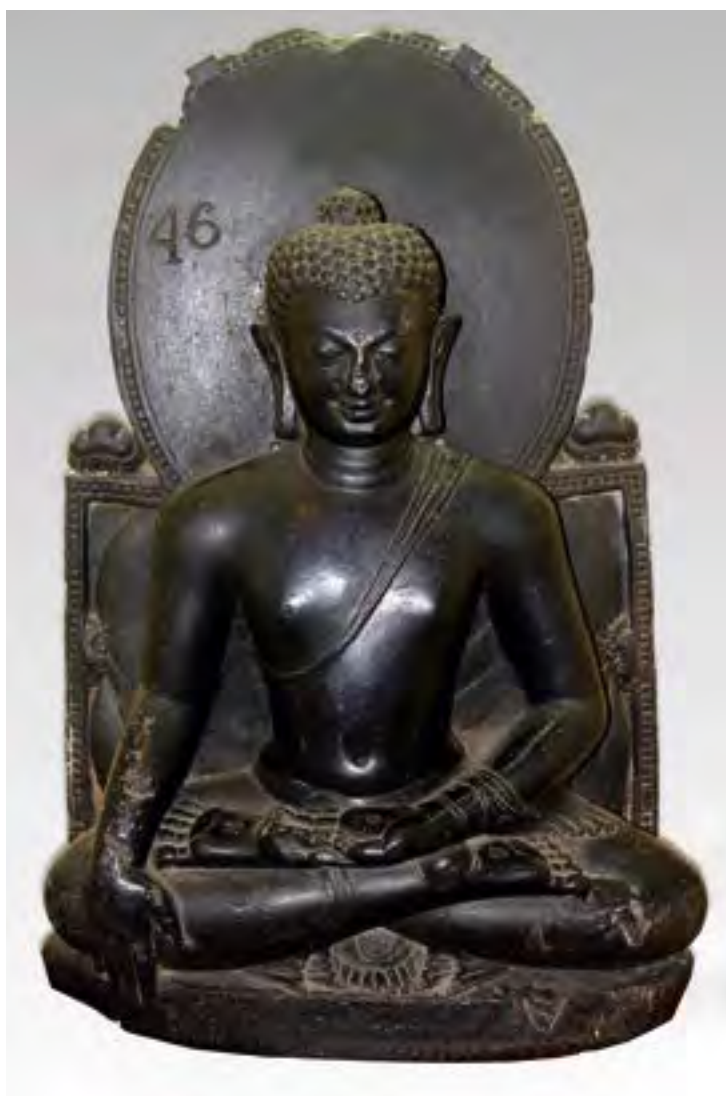
Fig. 3 (right): Seated Buddha, Bihar, India. Stone, H. 74 cm. 8th century. Collected in Indian Museum, Kolkata.

How should we interpret the appropriation and misrepresentation in the Thousand Buddhas Cliff in Guangyuan? Both Buddha and Kṣitigarbha are depicted wearing monastic robes, with cushions or mandorlas placed behind the statues. These formal similarities played a significant role in reinterpreting the “Indian Buddha image” as a Kṣitigarbha image. This is not an isolated case, there are also instances in Guangyuan where Buddha statues are carved with gestures originally used for bodhisattvas. For instance, some statues from the same period are depicted with one hand raised, forming a sharp V-shape with the forearm and upper arm – a gesture typically seen in bodhisattva images in Indian styles, similar to the flanking bodhisattvas on the “Indian Buddha Image” clay tablets. Therefore, the appropriation of the Kṣitigarbha image should not be viewed as a spontaneous act of creativity but in conjunction with how Chinese artisans