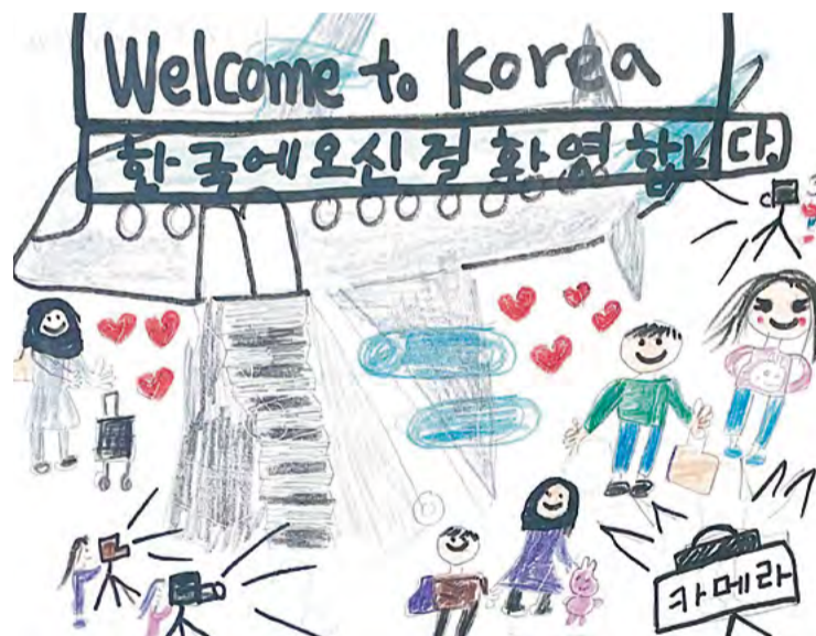
Fig. 1: The largest number of Afghan students were enrolled in Ulsan Seoboo Elementary School. At the end of 2022, Afghan students put together a classroom book called “Shiny Jewelry Box.” This is one of the stories included in this book. The text beneath the picture says “There were a lot of people at the airport. There were so many cameras. They all said ‘Welcome to Korea.’ And we all got pretty dolls. It was so, so pretty.”

refugee issue of 2018” in that the universal human value of humanitarianism was strongly acknowledged in the case of the Afghan refugees.