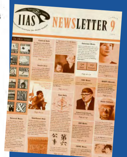
Fig. 1 (above): Issue #9 of The Newsletter (Summer 1996), an early point of connection between IIAS and Universitas Airlangga.