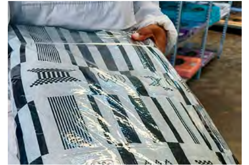
Above: Handloom Cloth woven in south India for the West African market at the Jansen Holland Shop, Tilburg.

The need for Dutch cloth producers to insert themselves into the market for handwoven textiles despite already dominating the market for expensive wax prints resurrects images of longstanding colonial exchanges. The dynamics of these exchanges speak to a long history of Europe's fascination with the African cloth market and the complex ways they have managed