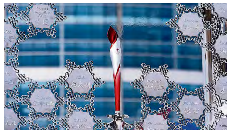
Fig. 1: 2022 Winter Olympics cauldron at Yanqing Winter Olympic Cultural Square.

China downplayed this political protest and asserted that the West should stop its anti-Olympic campaign. According to the Chinese authorities, such protests had no basis. The West, Beijing further argued, must not politicise an international sporting event as a way to realise their diplomatic aims. The communist regime even warned that it would retaliate resolutely against any attempt to damage the Winter Olympic Games on Chinese soil. Nevertheless, scepticism of China in the West showed no sign of abating. Eventually, no Western VIPs – except a few IOC members – travelled to Beijing to see the Olympic Games in person. Indeed, the “royal box” at the Olympic stadium was