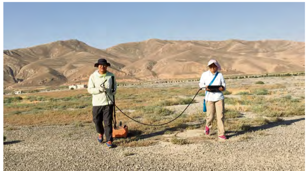
Fig. 2: Ground penetrating radar survey at Tepe Naderi.

The concept of the Silk Road is too familiar to readers to require any explanation. What is important is that it has been a dynamic road network connecting East Asia, West Asia, South Asia, Russia, and Europe, and that Iran has played a particularly significant role in its history. This is no coincidence because Iran is located right at the crux of the road network; in addition, the peoples of Iran have been very active in spreading goods, technologies, and religions across the Eurasian landmass. In particular, contact between China and Iran has been very close, as is eloquently borne out by the Sino-Iranica of Berthold Laufer and The Golden Peaches of Samarkand of Edward Shafter.