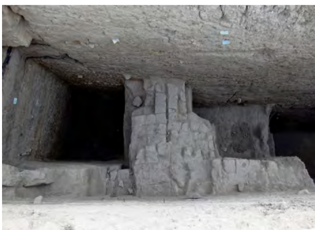
Fig. 1: Mud-brick walls of the Bronze Age at Tepe Naderi.