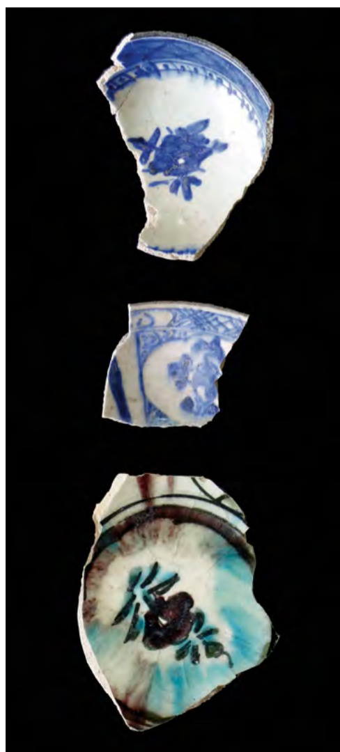
Fig. 3: Fragments of blue-and-white stonepaste ware of the Islamic period found at Tepe Naderi.