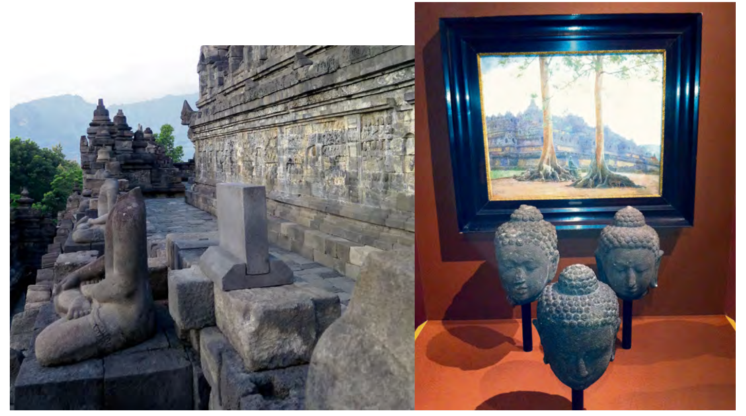
Fig. 2. Gallery of Borobudyr, with headless Buddha Statues, 2016.

Provenance research, as conducted within PPROCE, encompasses not only the question of origin but also the socio-political biography of an object: the histories and circumstances of the various transactions (including pillage) that have occurred from the moment an object disappeared from its original site to the moment it ended up in a museum. Whilst the research by PPROCE produced salient descriptions of looting or donation under duress, often, despite thorough research, this transactional history remains shrouded in mystery. These transactions were seldom or never recorded - by collectors, donors, or recipients. Which is in fact strange. Those