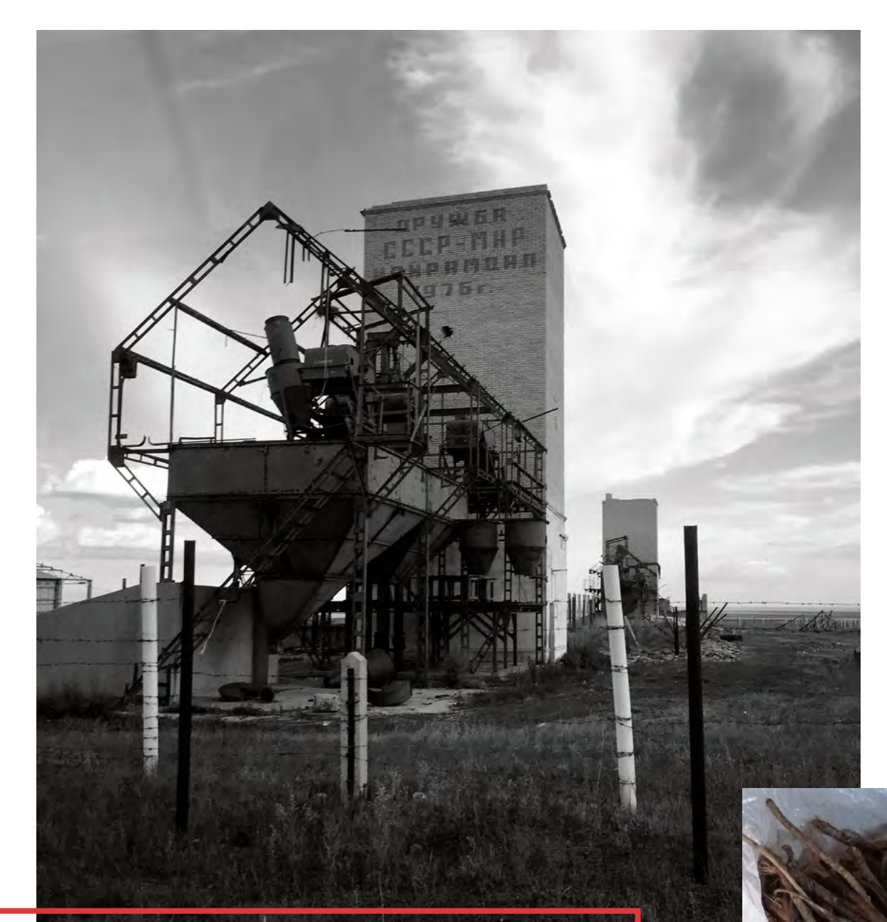
Fig. 1 (left): Magtaal's socialist infrastructure, incl. its hot water, electricity and wheat sieving facilities (pictured here), was completely stripped for scrap metal in the post-socialist transition.

Illegal wildlife trade as a subsistence and credit-repayment strategy