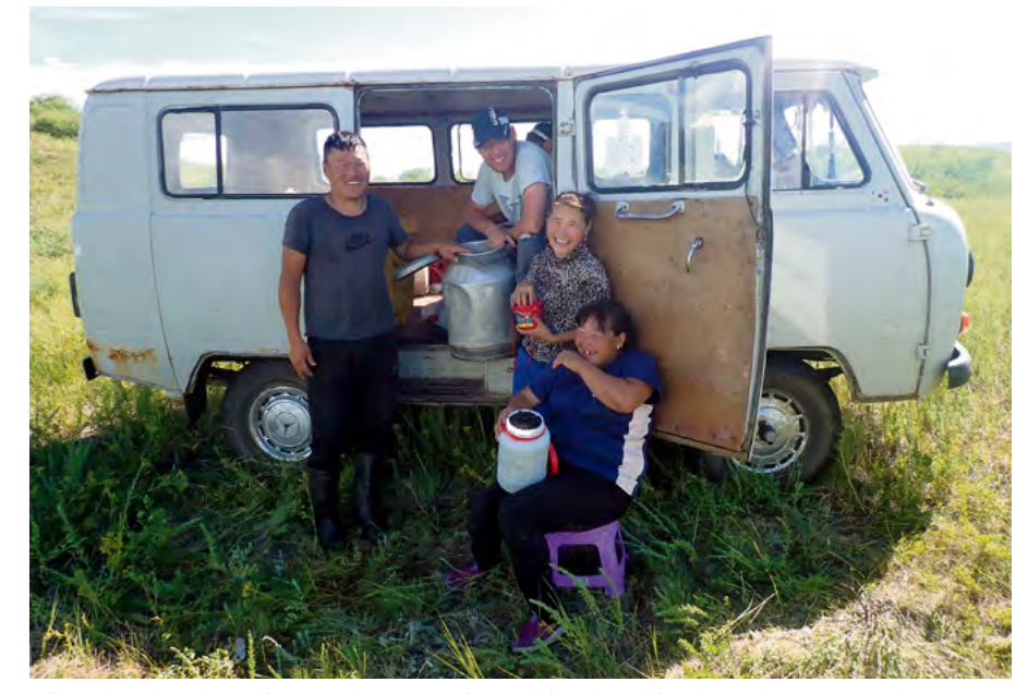
Fig. 3: Local residents often travel in groups of trusted friends and family members to sweep the countryside for resources. Here, a group of berry procurers enjoy their day's haul.