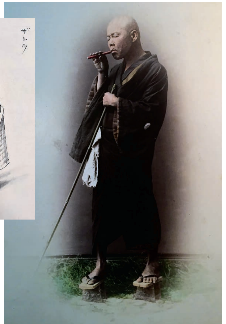
Fig. 6 (right): Untitled (Blind Masseur), photographer unknown, late 19th century, Furness collection, Courtesy of the Penn Museum.

settings, this pair focuses on the costumes and bodily characteristics. Though space is limited to discuss other examples, there are other pairs that show similarities between Keiga's illustrations and souvenir photographs.