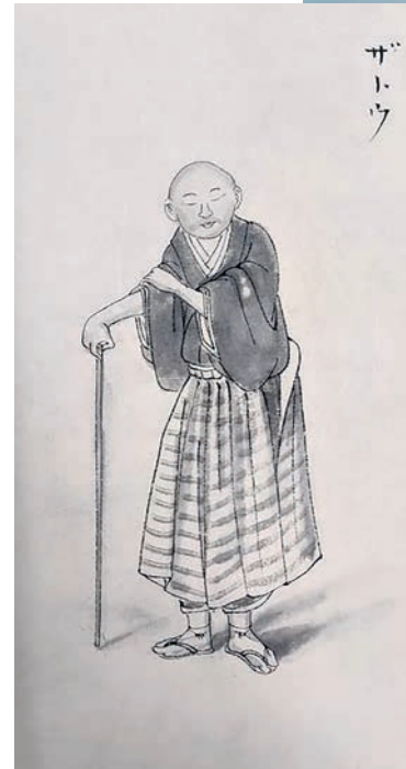
Fig. 5 (above): “Blind musicians and a blind masseur” (RV-1-4483-15), Kawahara Keiga, 1823-1829

The choice of subject and the simple composition of this illustration resemble photographs made after the 1870s. Felice Beato and other photographers produced many images similar to this type of occupations images, though it is unlikely that photographers in Japan would have had access to Keiga's illustrations. Figure 6 is a photograph of a blind masseur. The illustration and the photograph both show the bald men with their eyes shut. Their closed eyes and the canes signal the blindness. The postures of the models and the things they are holding correspond to each other. Rather than creating an imaginary scene with specific