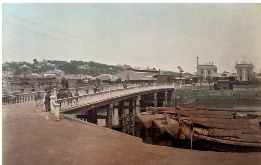
Fig. 3 (above): “18 Railway station, Yokohama,” photographer unknown, late 19th century, Album 63, Courtesy of Kurokawa collection.