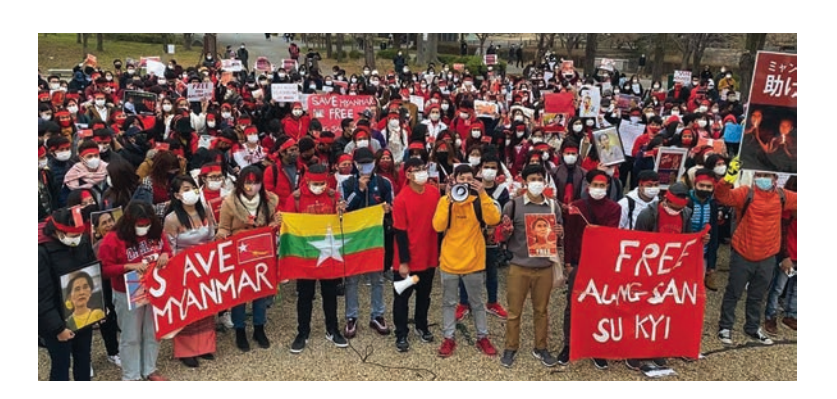
Fig1: Myanmar residents in Japan protesting at Osaka Castle Park on Feb. 7, the first Sunday after the military coup.

1 The goal of the foreign technical trainee sustem is to support foreign nationals who have acquired skills and knowledge in Japan so that they can contribute to economic development in their developing home countries. However, the system suffers from several problems, such as poor working conditions and delayed wages.