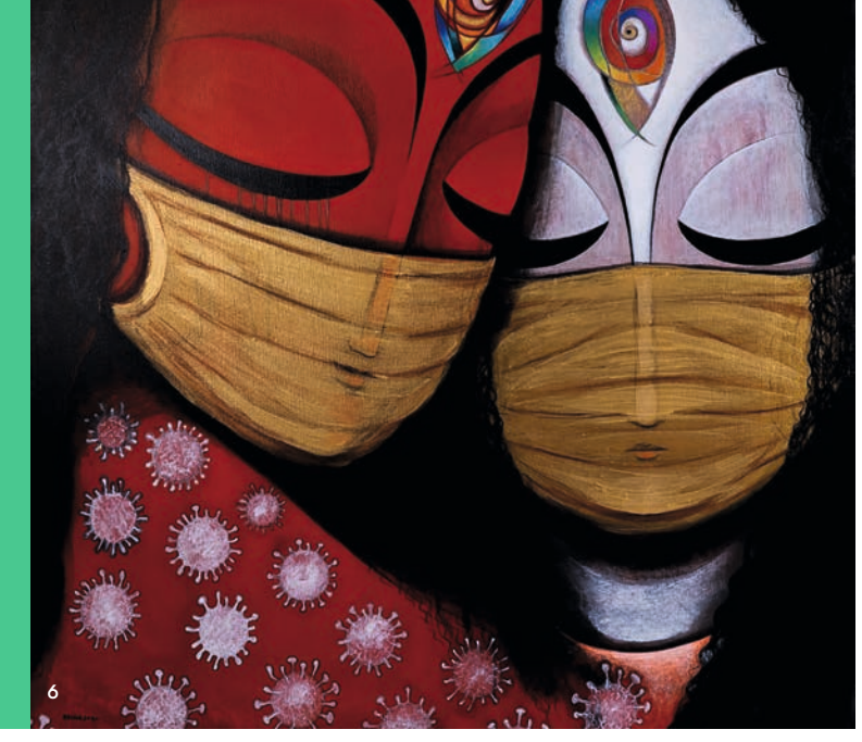
Fig. 6: The variable gem, by Erina Tamrakar.

encircled by a ring of airplanes pointing in all directions, which surround a grid of scratchy designs and Nepali numerals, as if marking time on a prison wall.