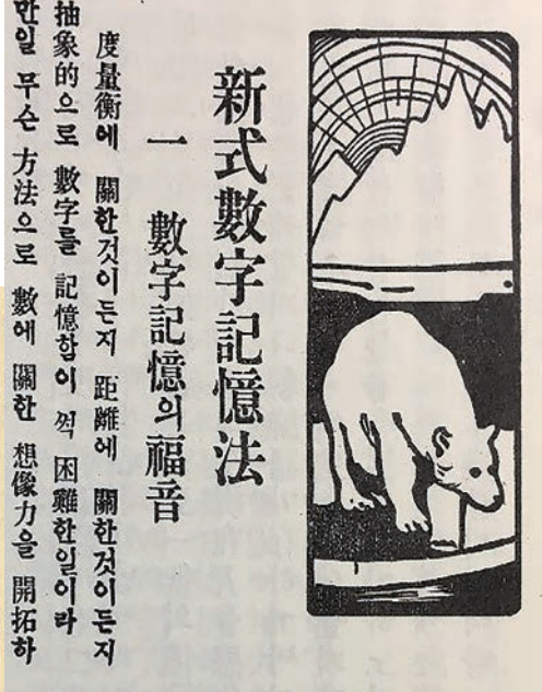
Images from Chugaku Sekai (中學世界) Issue 13-1 (published in January 1910) (left) and Cheongchun (靑春) Issue 1 (published in October 1914) (right). In this case (and other similar cases), the article itself was not translated but the illustrations or layouts of Japanese texts regarding world topics or events were referenced. Images of the original articles scanned by the author.

Another characteristic feature of the translations in Sonueon is the revision of the text so that 'boys' - the magazine's readership (sonyeon means 'boy' in Korean) – are addressed directly and the expectations for these 'boys' are clearly expressed. One example would be the addition of the following sentence at the end of the article 'The Youth of Edison, the King of Electricity' [電氣王애듸손의少年時節] to express an expectation for these 'boys': "We wish to know what kinds of trees and eggs of invention are being fostered and hatched in the future in Korea" [新大韓에는 어떠한 発明의 나무가 자라가고 알이 깨여가는가를 알고자하오].