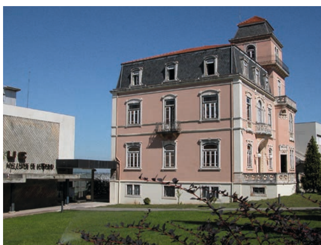
Above: Faculty of Economics of the University of Coimbra.