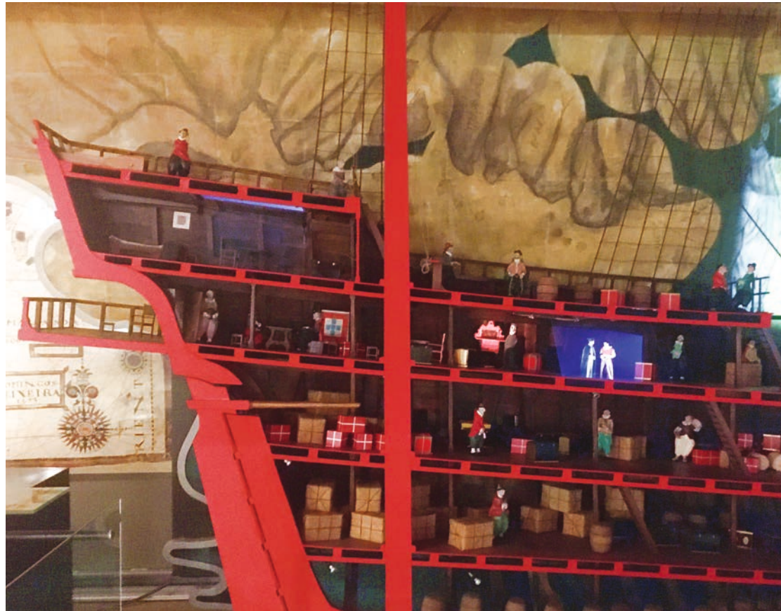
Above: Black Ship Model at the Museum of the Macau Scientific and Cultural Centre.