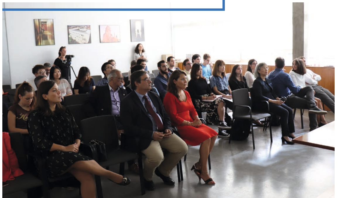
Below: Opening Session of the 2019/2020 edition of the advanced course 'China and the Portuguese-speaking Countries in World Trade' on Oct 11, 2019. Property of the course.

Since its inauguration in 1999, the Macau Scientific and Cultural Centre (in Portuguese, Centro Científico e Cultural de Macau, which can be abbreviated to CCCM) has become recognized world-wide as an important focal point for research on Portuguese interactions with China since the sixteenth century. The CCCM is unique since in its premises it includes a richly-stocked museum, and also possesses the largest library in Portugal of research literature on China, along with a collection of rare and valuable manuscripts and archival documents.