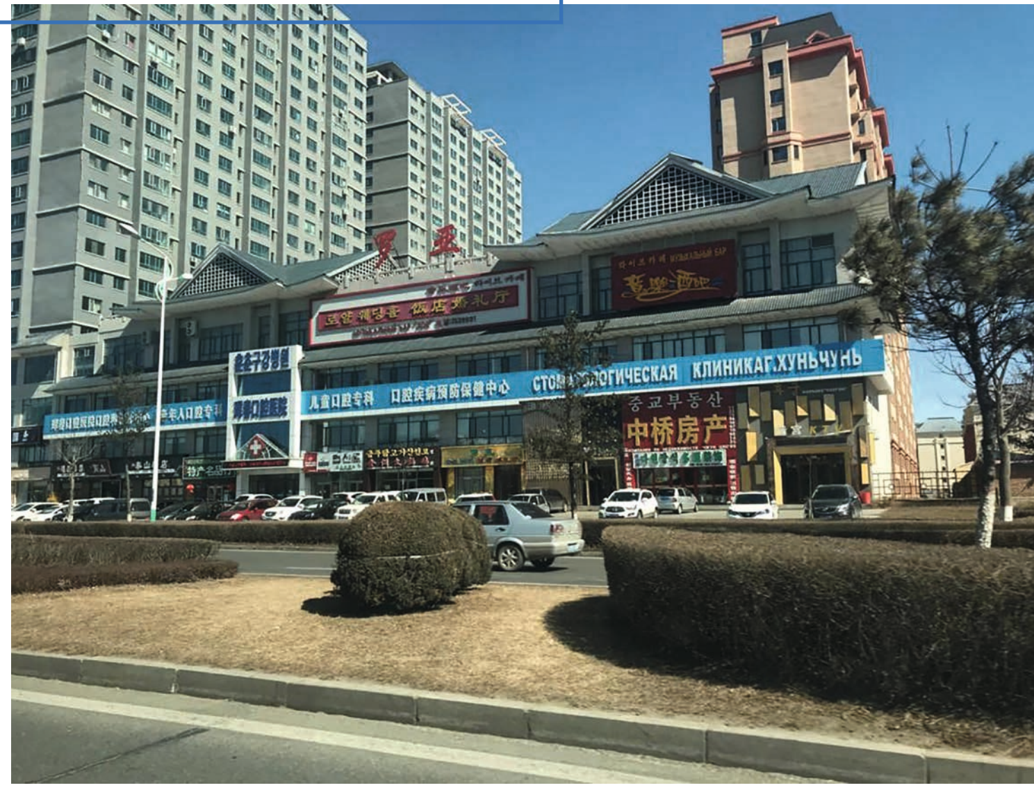
The 'three language landscape' of Hun Chun.

The Hun Chun Export Processing Zone is one of the first 15 export processing zones in China, with a planned area of 2.44 square kilometers. With the continuous adjustment of national industrial policies and increasing requirements for the transformation and upgrading of export processing trade, export processing zones experienced rapid development. They feature a characteristic industrial pattern of woodwork processing and seafood processing, supplemented by cross-border e-commerce and bonded logistics. At present, the planned area has been adjusted to 1.038 square kilometers, and the area consists of 'seven connections and one leveling'. The Hun Chun China-Russia Trade Zone covers an area of 9.6 hectares. It was put into trial operation in December