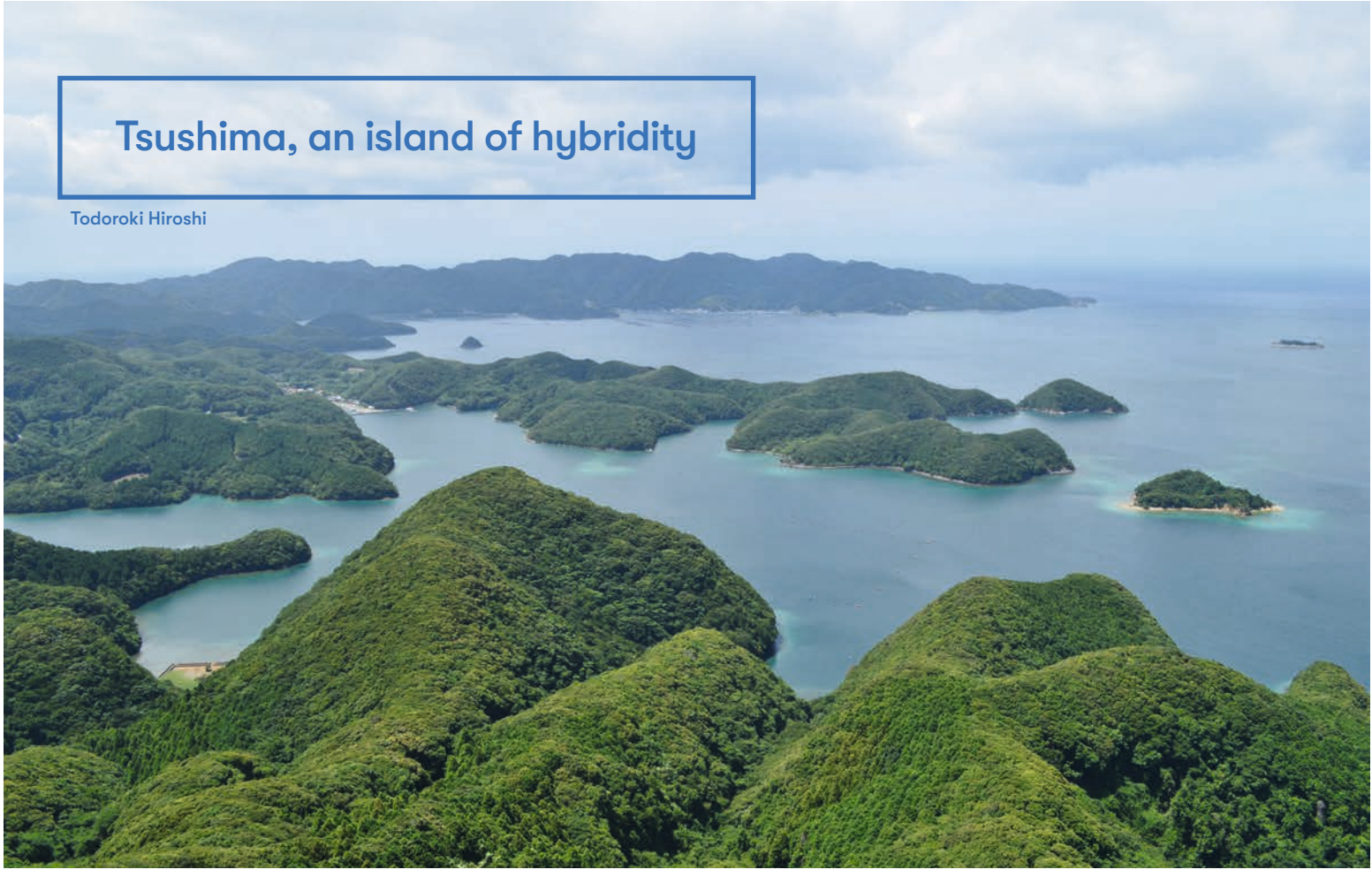
Aso Bay viewed from Mount Jo.

sushima is located closer to the Korean peninsula than Japan; it is less than 50km away from the Korean island of Geoje. From the Kankoku Lookout in Waniura, at the northern end of Tsushima, the landmarks of Busan, South Korea's second largest city, can be seen on clear days and even its fireworks at night. Since the beginning of history, the island has been a geopolitical mirror of Korea and Japan; its people have survived by negotiating the politics between the two. Indeed, the reason that the people of Tsushima are described as 'cunning' in a number of historical and literary documents may be due to their strategies for survival.