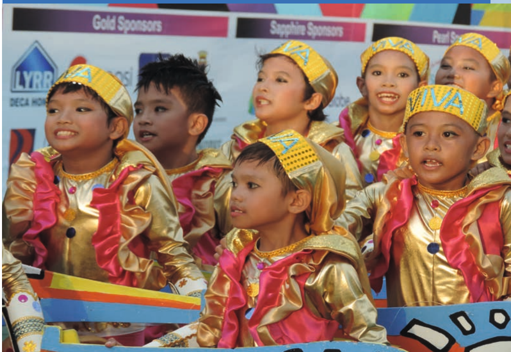
Boys and girls at the Voyadores Festival in Naga City, Bicol, Philippines, in 2017. At the Voyadores Festival, which runs in conjunction with the massive Peñafrancia Festival, Asia's largest Marian religious event, boys and girls engage in 'street dancing' in competitive teams. In this dance, the boys play the part of the 'voyadores' who row in small boats tethered to a barge that returns the sacred effigy of Mother Mary, known locally as 'Ina', to her permanent year-round home in a basilica upriver.