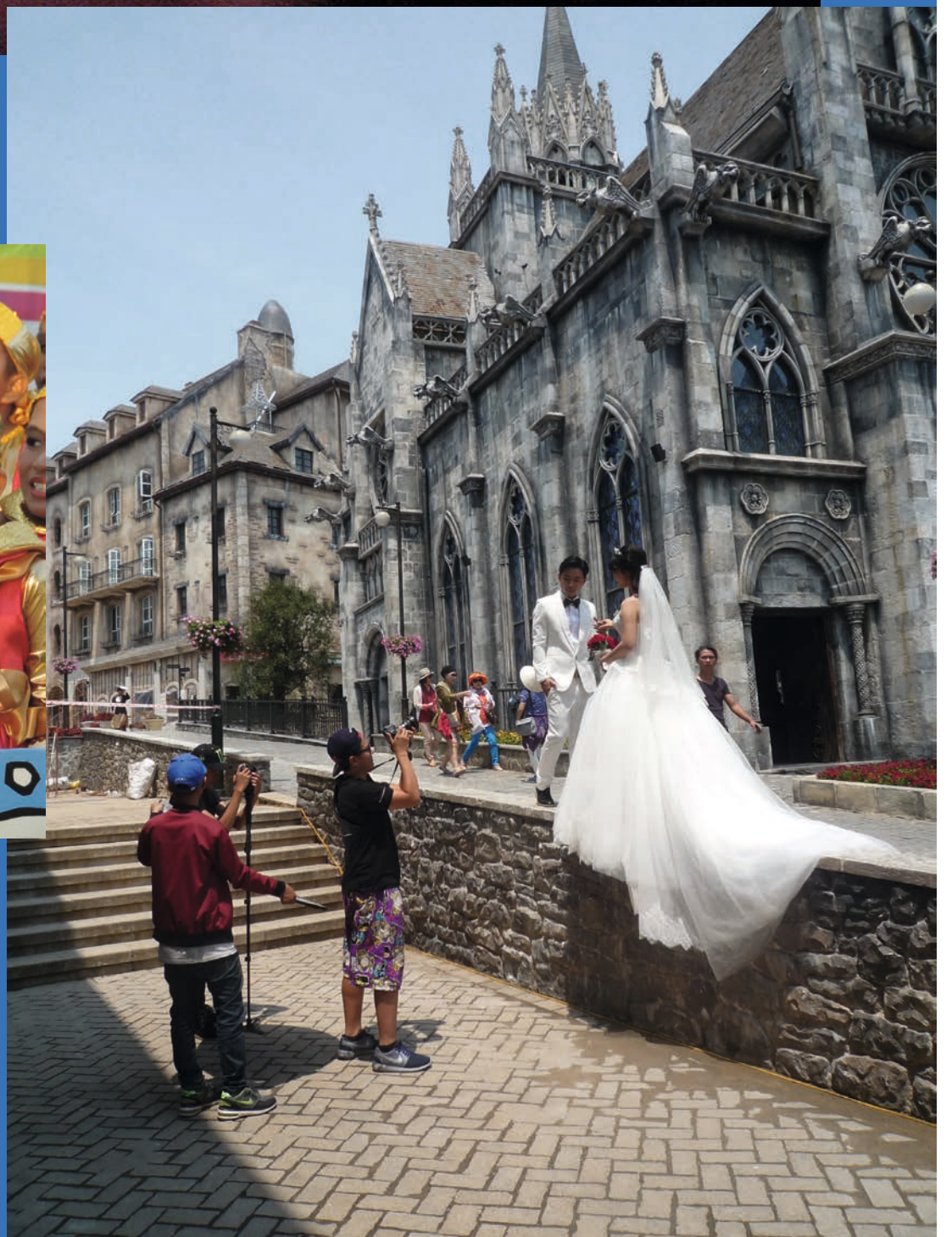
Right: Emmanuelle Peyvel, Honeymoon in Bana, Vietnam This photo was taken in Bana's hill station, in the center of Vietnam. First established by the French settlers, the original buildings are long gone. The station was entirely rebuilt as a French village imitation by Vingroup, a Vietnamese joint stock company. The village has its own cable car station, castle and cathedral. Associated with French romanticism, the station is a popular backdrop for honeymoon photos.