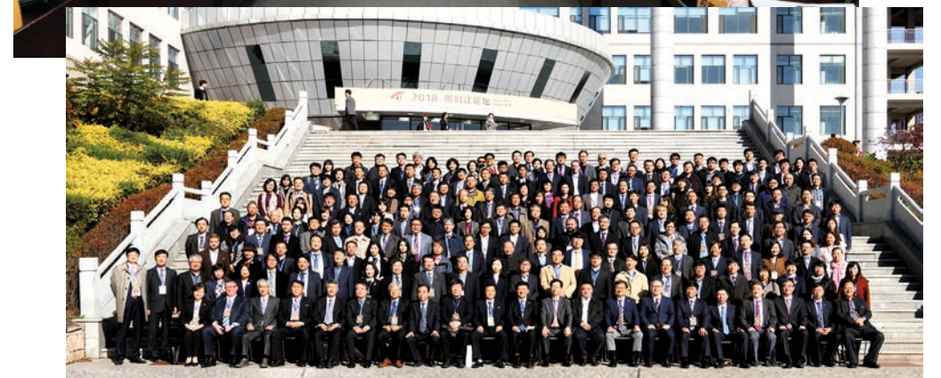
Above: Participants of one of the sub-forums of the 2018 Tumen River Forum (Image provided by the organizers of the Tumen River Forum). Below: Official photograph of the participants of the 2018 Tumen River Forum. Image provided by the organizers of the Tumen River Forum.

roundtable, entitled 'China-DPRK scholar's dialogue', centers on regional political collaboration and is attended exclusively by scholars from China and the DPRK. In 2018, the two topics addressed at this roundtable were 'DPRK's tourism and China-DPRK tourism cooperation' and 'China-DPRK cooperation and peaceful development of Northeast Asia'. The 2018 roundtable was attended by five scholars from China and five scholars from the DPRK, the latter of whom were all based at Kim Il-sung University.