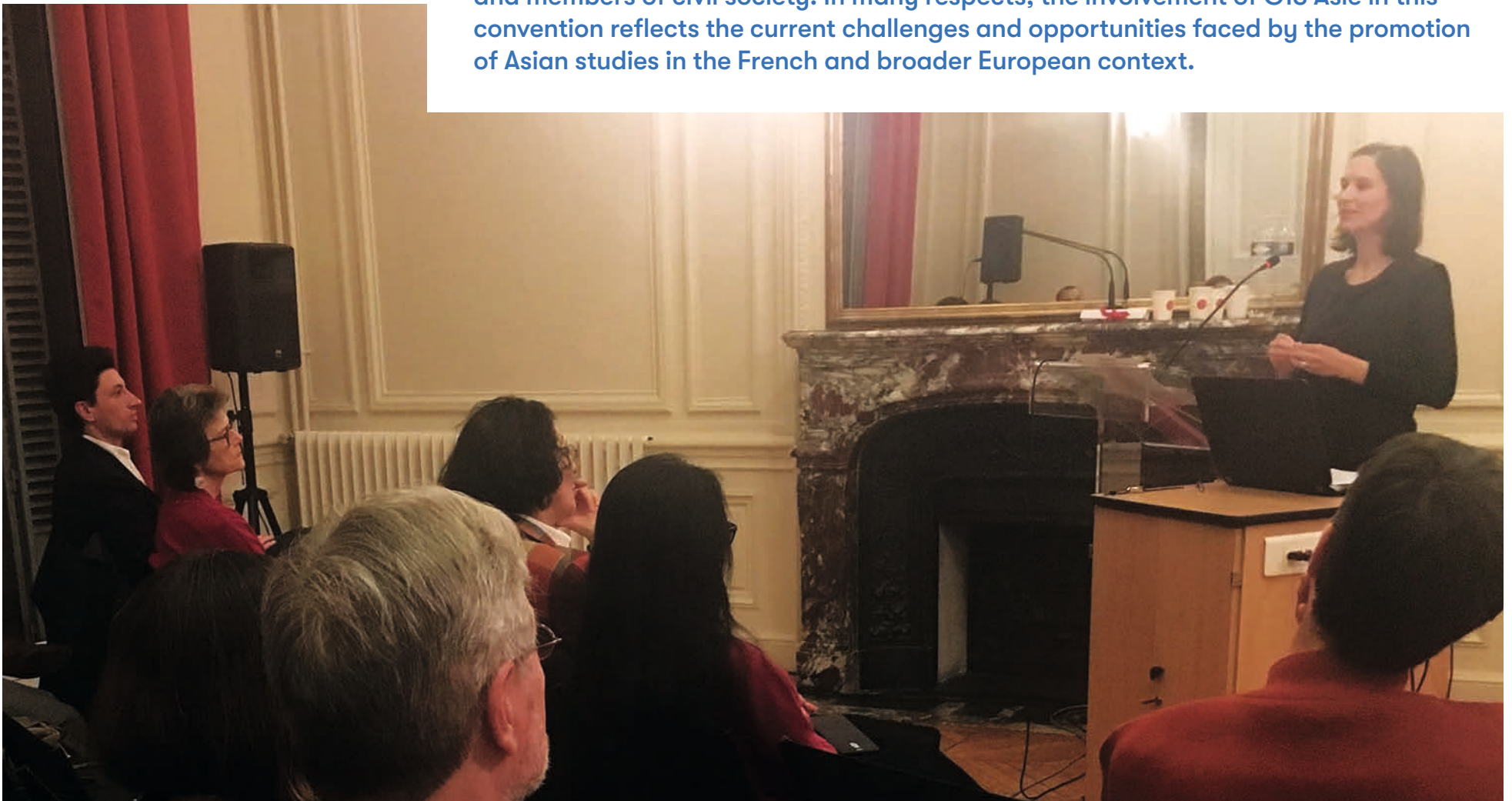
Below: Ph.D. thesis Prize ceremony award at Maison de l'Asie, Paris January 2019.

This summer, the French Academic Network for Asian Studies (GIS Asie) will be co-organizer of the 11th International Convention of Asia Scholars (ICAS), together with the International Institute for Asian Studies (IIAS) who hosts the ICAS Secretariat at its offices in Leiden, and Leiden University, this edition's local hosts. This major event will offer scholars an opportunity to gather and share their research, publications, and projects. It will enable them to meet with other scholars, publishers, specialists, and members of civil society. In many respects, the involvement of GIS Asie in this convention reflects the current challenges and opportunities faced by the promotion of Asian studies in the French and broader European context.