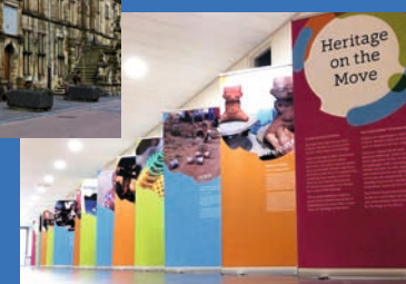
Above: Trianon cinema. Far left: Leiden City Hall. Left: 'Heritage on the Move', a photo exhibition by Leiden Global.