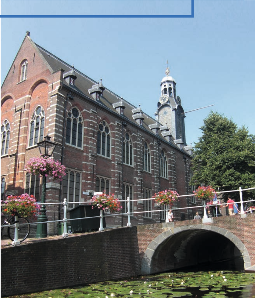
Above: Leiden University Academy Building.

And that brings us to this year's ICAS meeting. Nobody could have predicted that it would take 21 years before ICAS would return to its place of birth. Has it fully grown up? By no means. There is still a world and more to explore for this fledgling. Yet we have learned a lot over the past 2 decades and hope to bring our combined experiences to this meeting on our home ground.