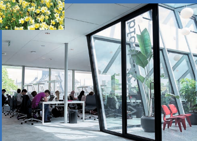
Above left: Hortus Botanicus Gardens. Above right: Textile Research Centre workshop. Right: The Asia Library. Far right: The International Institute for Asian Studies on the Rapenburg.