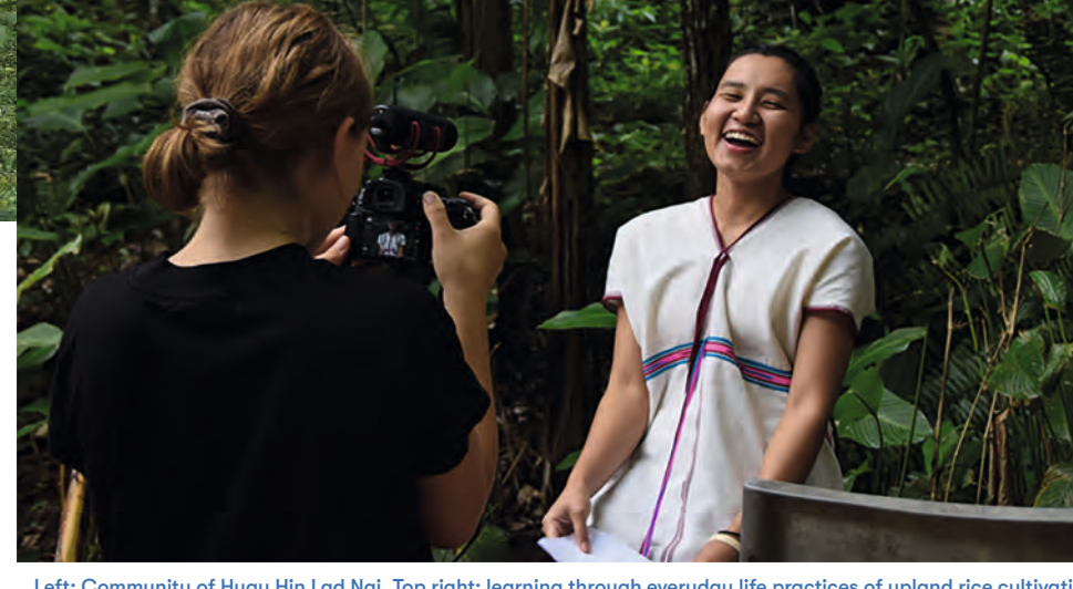
Left: Community of Huay Hin Lad Nai. Top right: learning through everyday life practices of upland rice cultivation. Inset above: Film Making. Living in and with the Forest.

It is noteworthy that learning processes in the Huay Hin Lad Nai community take place in different social contexts, i.e., within the community, in the form of a transgenerational knowledge transfer between elders and the youth, as well as in the interactions and exchanges between community members and outsiders, such as other ethnic groups, NGOs and academics. In line with this, the CESD's