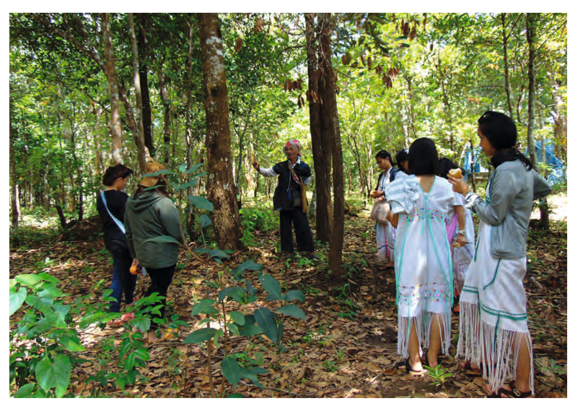
Youth researchers learn from their grandfathers.

villagers collaborated with NGOs and forest officials to produce maps depicting the land use of the community in order to demonstrate to the public that Rai Mun Vien is a form of local knowledge, different from slash and burn agriculture, as well as to show that their own communities are taking serious efforts to conserve their natural resources.