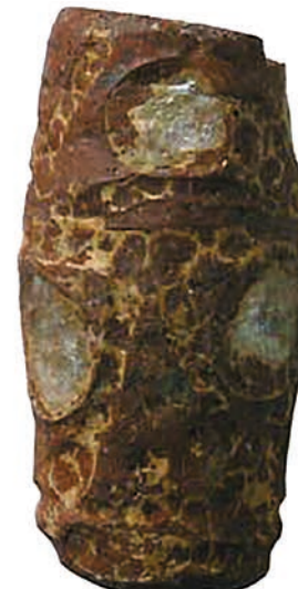
Inlaid glass bead from Neukdo which may possibly have Southeast Asian origins. From Samgang Institute of Cultural Properties, 2006, Neukdo Shellmidden III – Area 3 burial ground , p. 130.