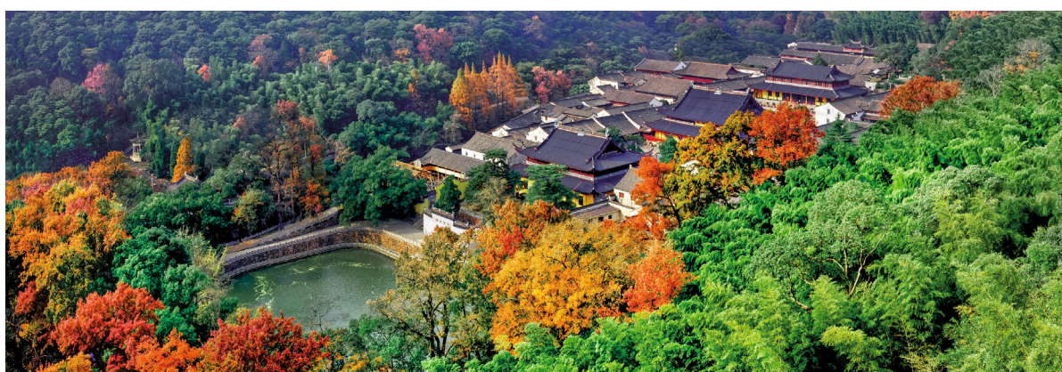
Tiantong Buddhist Temple, Jiangnan, China.