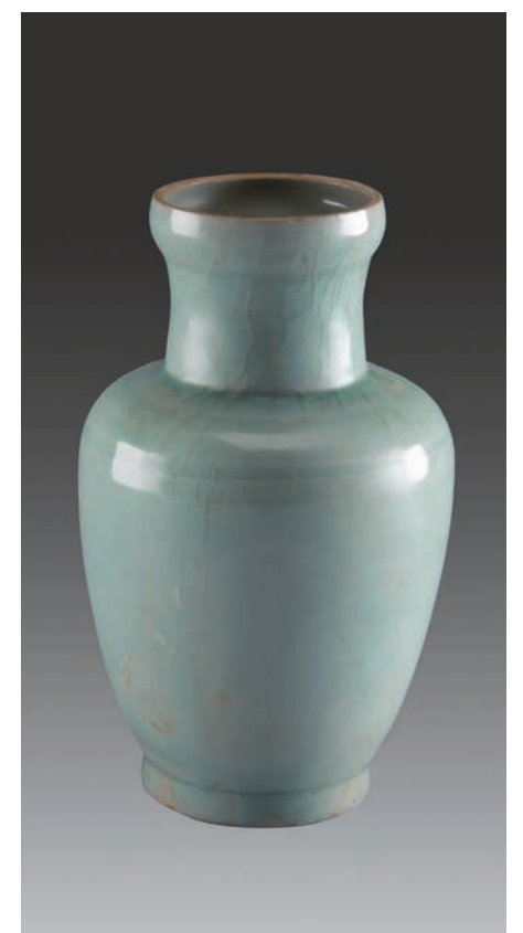
Celadon from Yue Kiln

Chinese porcelain had been exported to foreign countries from the ninth century, but became more popular during the Song and Yuan dynasties. Kilns specializing in export porcelain were founded in the southeastern coastal areas, and inland kilns were relocated to the coastal areas to boost export. Also, early Korean celadon imitated, in terms of glaze color and shape, similar vessels produced in Zhejiang's Yue Kiln. The Korean technique of pottery became increasingly more sophisticated, culminating in its own worldly famous brand, Korean celadon, which was introduced back to China. The prosperity of porcelain trade has been extensively explored by scholars, and is regarded as a fundamental basis for the sustainability of the Maritime Silk Road.