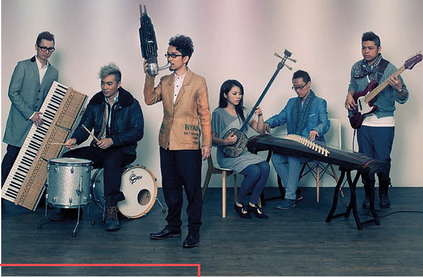
'Sonic Traveler' is a jazz fusion band from Hong Kong that combines Western and Chinese instruments.