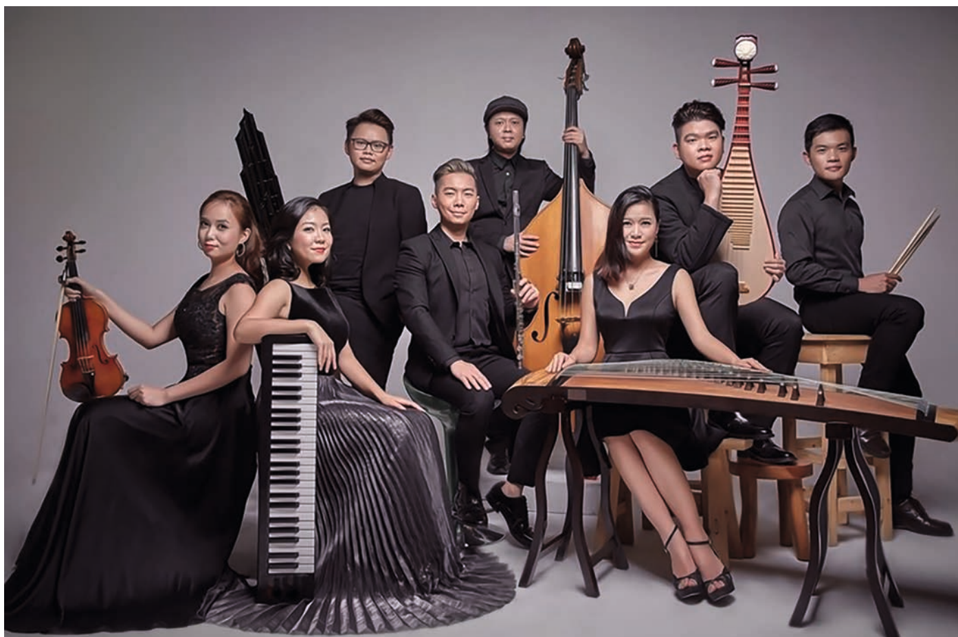
Malaysia's fusion ensemble 'Eight-Twelve' deftly brings together elements of Chinese and Western music to create innovative compositions.