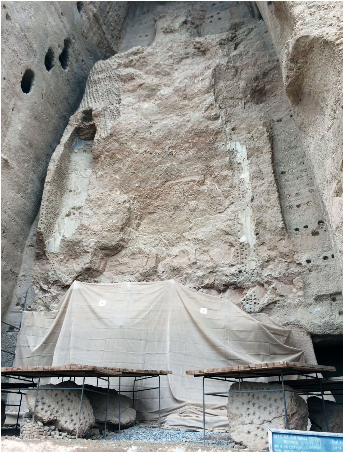
The eastern Buddha with the 'feet' concealed behind plastic sheeting in 2015.

contract to work in Bamyan, accusing the organisation of making new constructions that threatened the Outstanding Universal Value of the site.