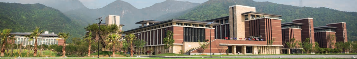
The Wenzhou-Kean campus building

AS A SCHOLAR AND FICTION WRITER, I am interested in utopian narratives and the ways that places designed upon an ideal can influence the population that inhabits them. So it isn't surprising that I classify Wenzhou-Kean University (WKU) as a type of utopia. Our university is utopic, not in the sense that it is a perfect place, but in that our community was conceived of as a remedy to educational issues, such as China's alleged education system that tends to prioritize memorization over the development of problem-solving skills with real-world application and Chinese students' lack of preparation in developing global citizenship.