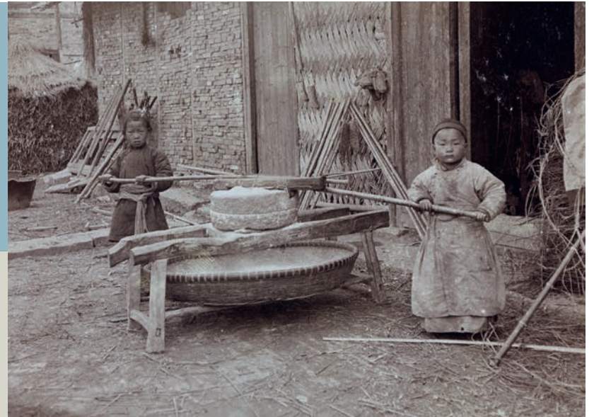
Above: Children grinding grain, at a farm. Wv-s112.