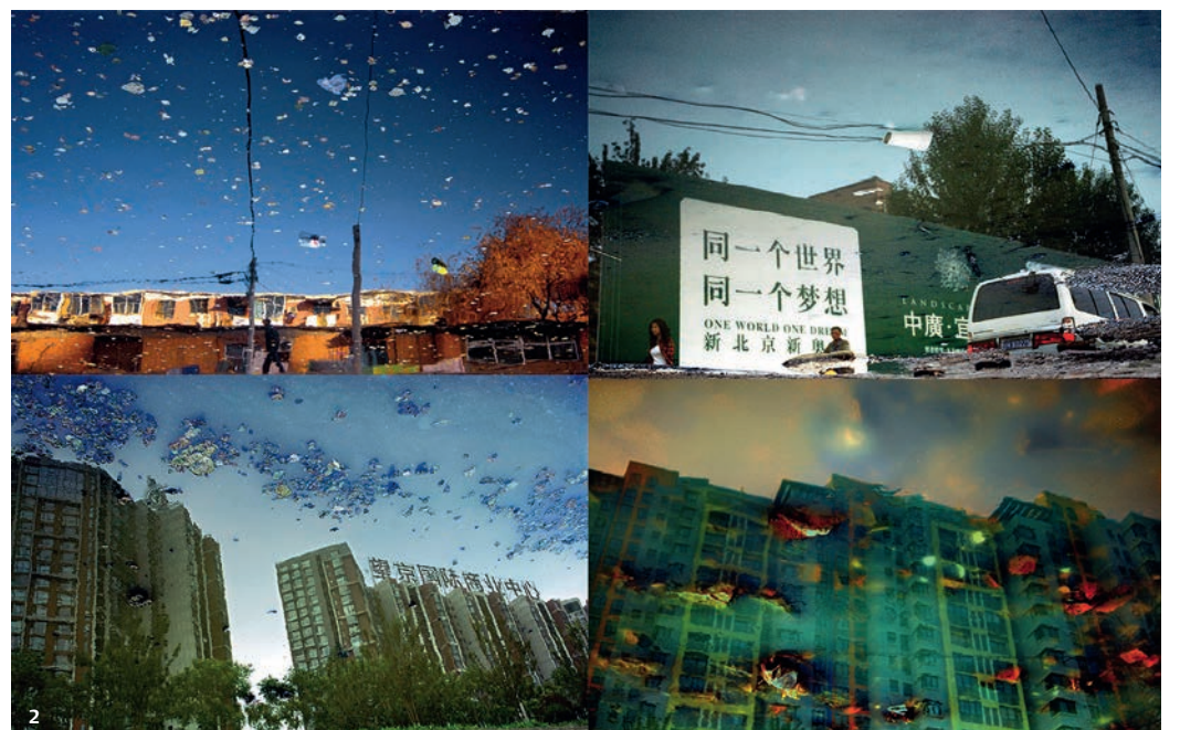
Fig. 2: Han Bing, selective pieces from Urban Amber , 2005-11, photography.