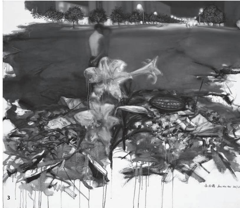
Fig. 3: Liu Xintao, Collapsing Night-Wild Lily , 2007, oil on canvas. Courtesy of Liu Xintao.

In 2011, Wang released his first documentary, entitled Beijing Besieged by Waste , which combines photographs and video footage of many large landfill sites on the outskirts of Beijing (fig. 4), and of the scavengers, mostly migrant workers from the countryside, who live near and on the dumps. 15 Wang mapped the locations of more than 500 landfills surrounding Beijing, and this documentary is a striking summary of his discoveries in the hitherto unseen dirty backyard of China's capital. 16 The 72-minute video narrates Beijing's distressing cycle of consumption, the ill-managed and sometimes illegal operation of waste disposal, the appalling destruction of the environment including rivers, soil, and air, the horrific lives lived by scavengers and their children, and government negligence or implicit collaboration.