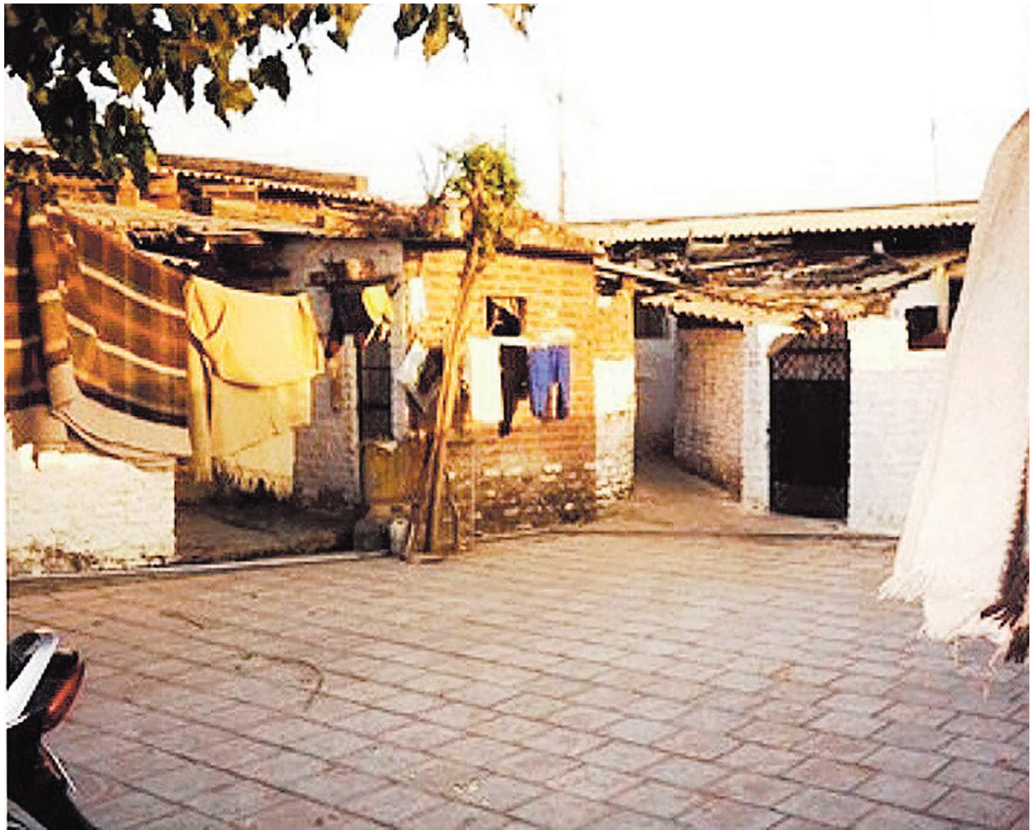
Above: Kashmiri Pandit migrant camp in Jammu.

Yet imaginations do not remain static. The nature of militancy in Kashmir has changed over the years with many