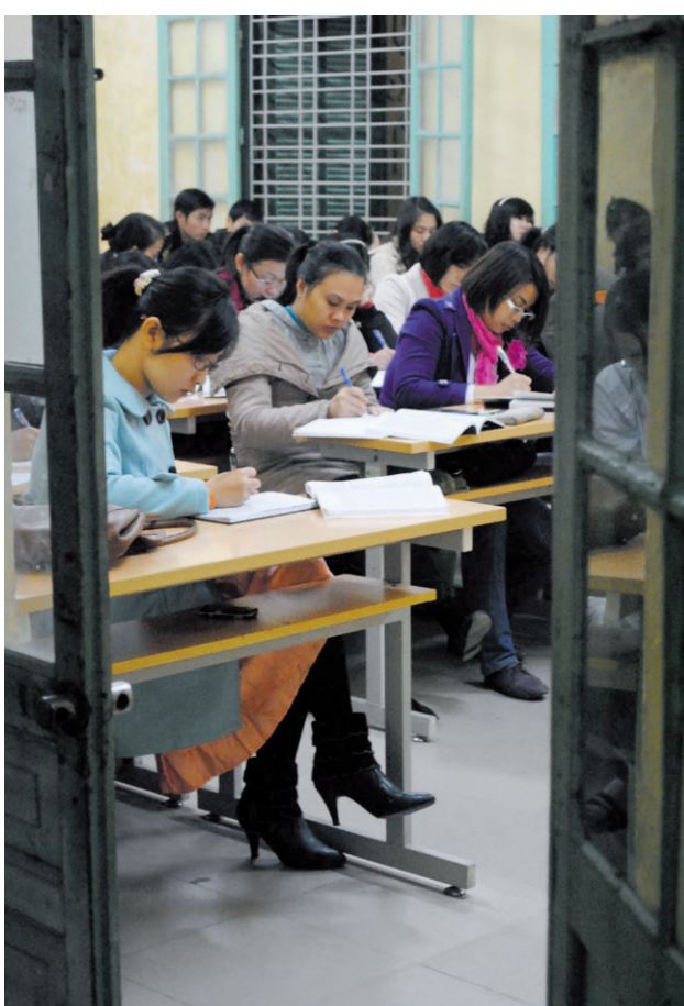
Above: Students hard at work in the shadow education system.

Above: A tutor and his student.