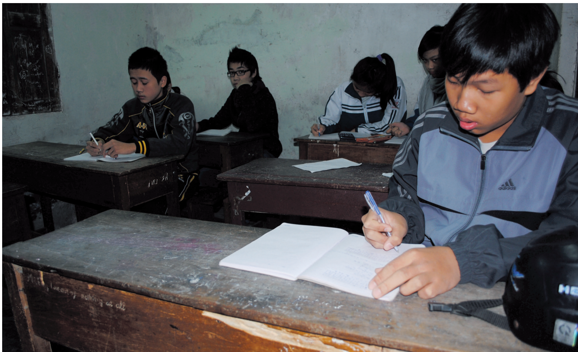
Right: The quality of facilities varies quite widely.

Some poor families in Vietnam are reported to either borrow money at high interest rates or even take mortgages on their property in order to send their children to private tutoring classes.