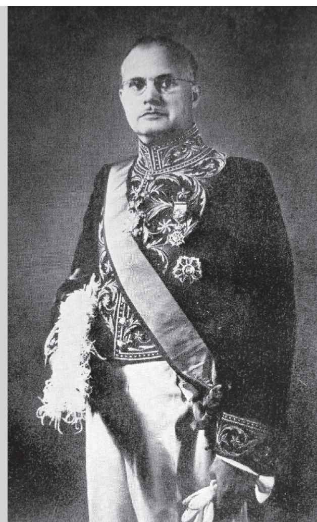
Above: Dr. Robert Hans van Gulik (1910-1967)