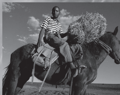
INSET TOP: Chinese dressage horse INSET MIDDLE: Besotho pony. INSET BELOW: Napoleon crossing the Alps on his horse Marengo.