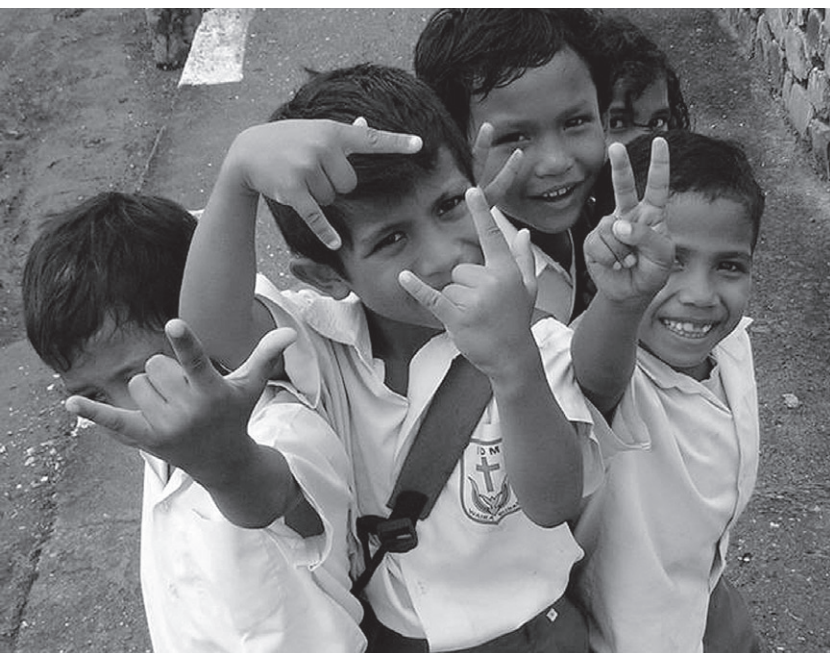
ABOVE: School children in Waikabubak.