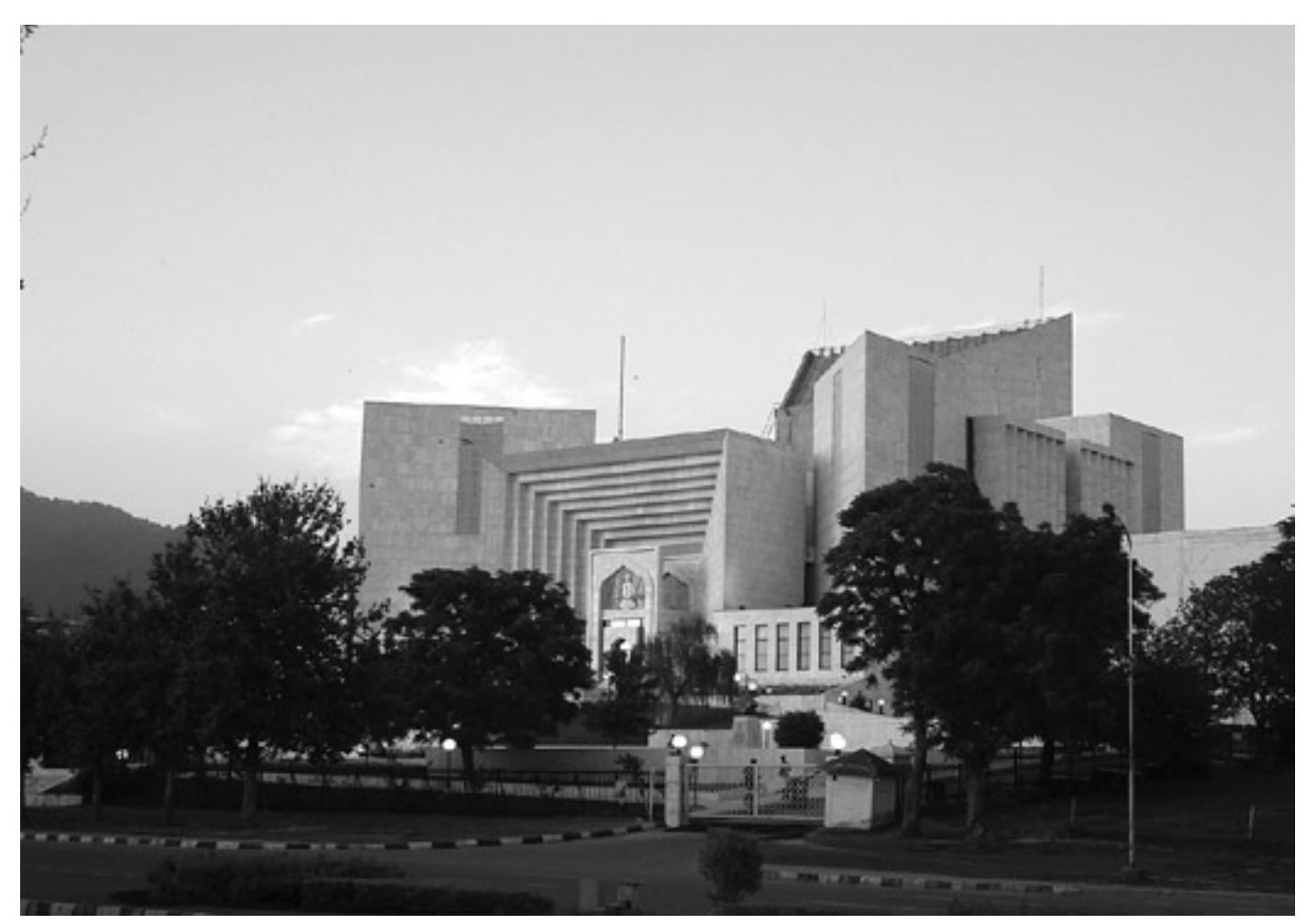
The Supreme Court of Pakistan.

new law can be seen as being supportive of the idea of restorative justice, and also as being in line with the customs of Pakistan's tribal areas, the consequences of this legislation have been particularly unfavourable for women, many of whom were killed by members of their own family in the name of honour. In a case where a brother had murdered his sister, it was the father who could pardon his son.