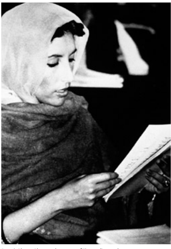
Benazir Bhutto.

Appended to the Act is a lengthy "Statement of Objects and Reasons". It takes the form of a short essay on the Hudood Ordinances which reads as an interesting exercise in putting the new thinking within the framework of Islamic ideology. Its opening statement establishes that in Pakistan all laws have to be in accordance with Islam and that the Protection of Women (Criminal Laws Amendment) Act, 2006 is a measure to achieve