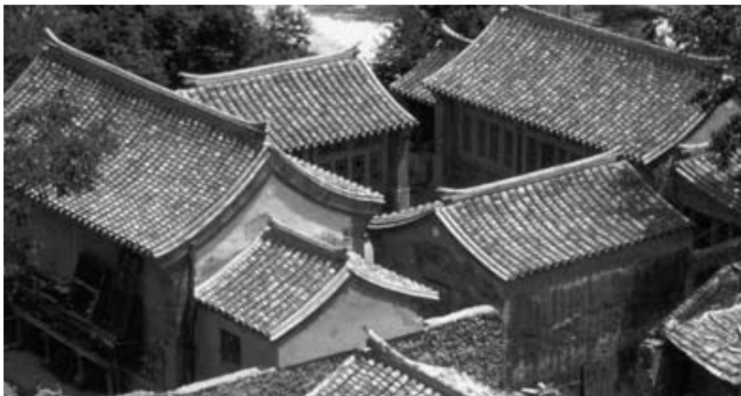
Courtyard house (siheyuan) in Chuandixia.

International Vernacular Architecture Unit, Oxford Brookes University mvellinga@brookes.ac.uk