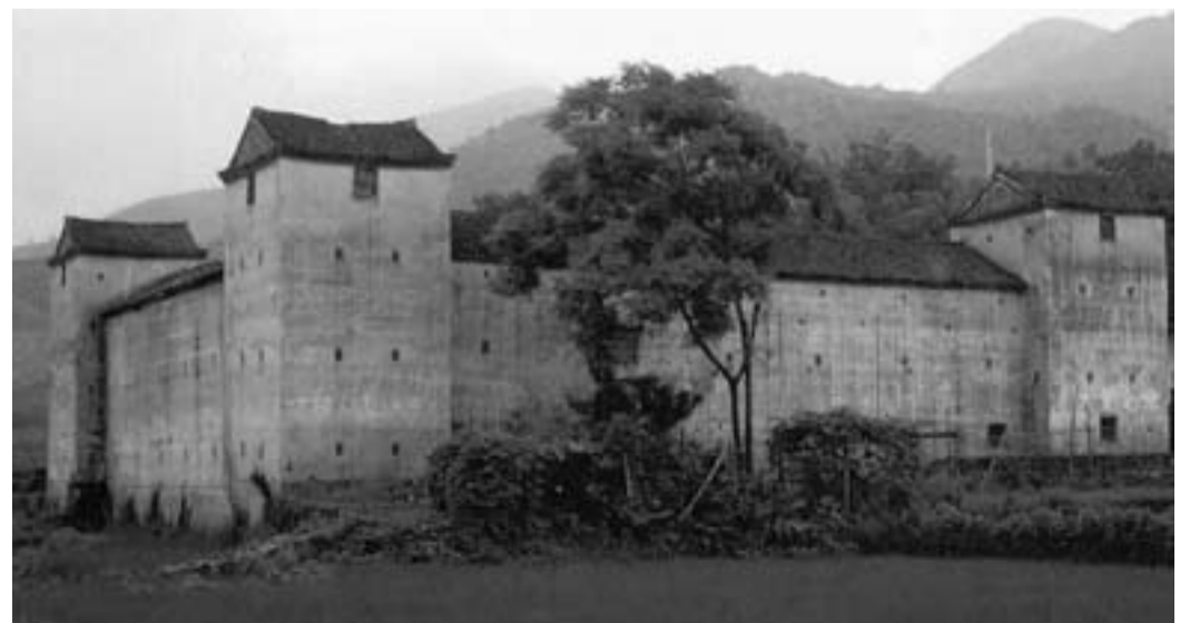
Fortress house in Xinyou village, Longman county, Jiangxi province.