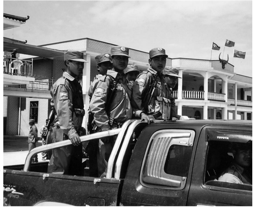
With an estimated 20,000 troops, the United Wa State Army is the largest ethnic opposition force in Burma

New Mon State Party, perceive the present peace process as one of 'legitimation'; none of the armed ethnic parties stood in the 1990 general election. Neighbouring governments, meanwhile, privately urge the same peace priorities on all ethnic organisations. Thus since the Cold War's end the 'regional conflict complex' around Burma has slowly transformed.