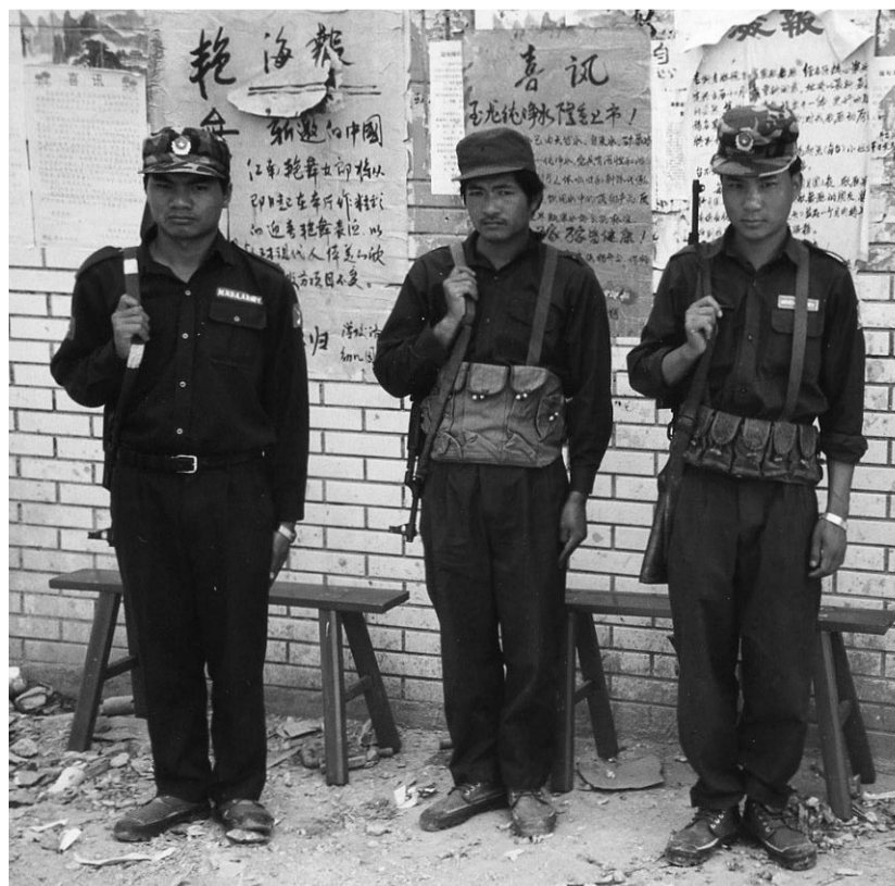
Kokang ceasefire troops near the Chinese border

Ceasefire critics accuse military leaders on all sides of opportunism reminiscent of General Ne Win's controversial Ka Kwe Ye 'home-guard' programme, which allowed selected ethnic forces, including those involved in opium trafficking, to maintain arms and control local trade as a means of stemming political opposition. For their part, ceasefire leaders argue that, unlike the KKY militias, the present agreements allow ethnic forces to join reform discussions and maintain arms and territory until a new constitution is introduced. Ceasefire groups, such as the Kachin Independence Organisation and