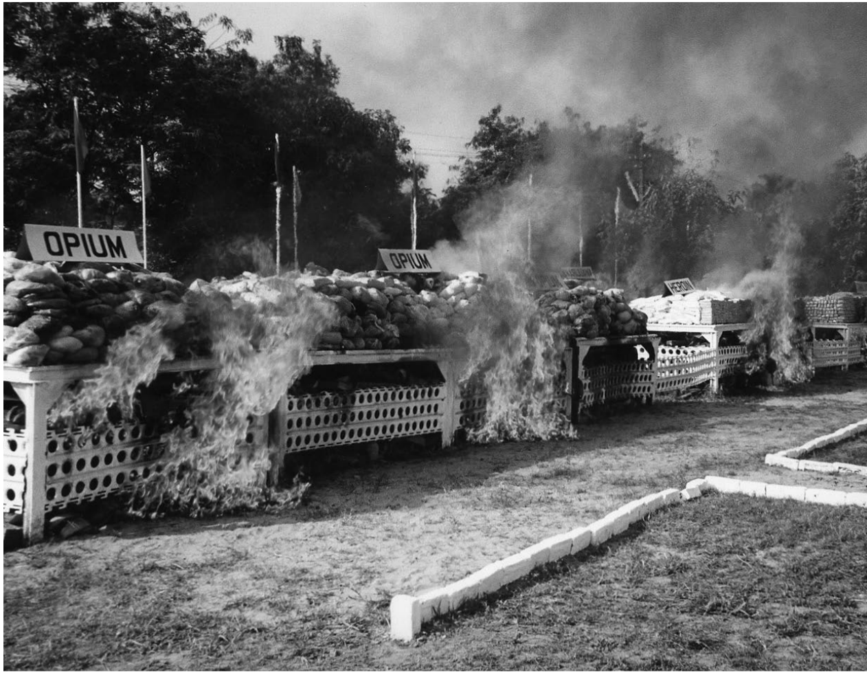
Drug burning ceremony, Rangoon