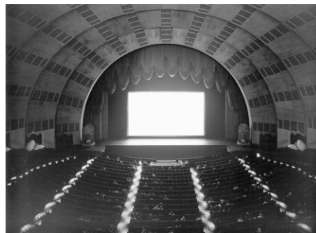
Radio City Music Hall, New York, Hiroshi Sugimoto, Japanese, born in 1948, Photograph, gelatin silver print. Image: 42.2 x 54.6 cm (16 5/8 x 21 1/2 in.) Sheet: 48.9 x 60.6 cm (19 1/4 x 23 7/8 in.) Museum of Fine Arts, Boston, Gift of Sylvan Barnet and William Burto in memory of Yasuhiro Iguchi, 1992-472

A loan exhibition of the images of Hiroshi Sugimoto, celebrated for his black-and-white series of seascapes, theatres, and the Sanjusangendo, Sugimoto combines traditional Japanese