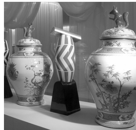
Part of cabinet service, porcelain with the emblem of Sichterman, China, Qianlong, approx. 1750, combined with vases by Alessandro Mendini, Title: Ambra Dolce and Alchemilla, 1993.

Ceramics from Ming to Memphis: East meets West In this exhibition, antique cabinet porcelain, tea and coffee services and other tableware from East Asia is compared and contrasted with post-modern ceramics from the end of the twentieth century, created by designers such as Andrea Branzi, Alessandro Mendini, and Ettore Sottsass Jr from the Italian design studio Memphis. The exhibition appears to cover two entirely different worlds, but it demonstrates just how closely related these worlds actually are. An unorthodox presentation of post-modern and traditional oriental ceramics ensures unexpected combinations that will not only challenge and stimulate visitors but also surprise them.