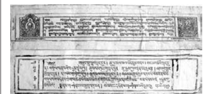
Block-prints 2740/H 46 and 2740/H 67, two different versions of old Bon text: Klu 'bum