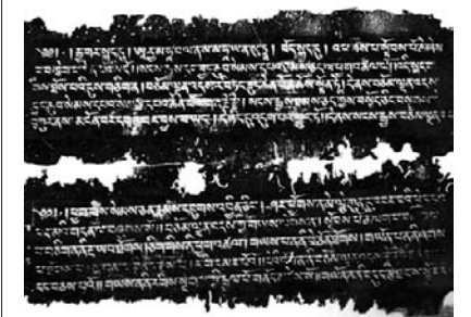
Manuscript 2740/o/2. Fragile manuscript in gold and silver