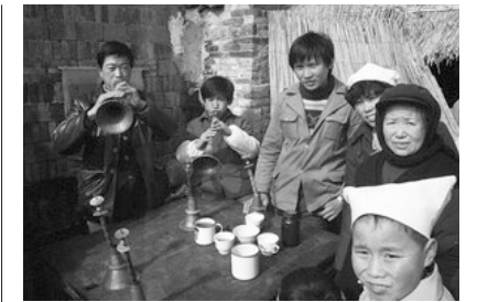
Folk musicians in Southern Jiangsu, China

Two themes will feature in the 10 th international CHIME meeting, which will be held in Amsterdam, the Netherlands on 6-9 October 2005, in conjunction with a major festival of Chinese music: 1) Exploring China's musical past (the reconstruction and reinvention of recent and older genres of music in China); 2) Audiovisual materials of recent fieldwork on (any kind of) music in China or among Chinese-speaking communities. The meeting will be held at the KIT Theatre (the Royal Tropical Institute), and is organized in cooperation with the Music Department of the University of Amsterdam and the International Institute for Asian Studies (IIAS). We welcome papers focusing on concrete examples -within the wider (contextual and musical) implications of the main theme. For the theme on recent fieldwork, we welcome scholarly presentations of audiovisual materials in any genre or area of Chinese music. Abstracts of up to 300 words for individual (20-minute) papers are welcome and should be sent by fax or e-mail to the Programme Committee at chime@wxs.nl , fax: +31-71-5123183.