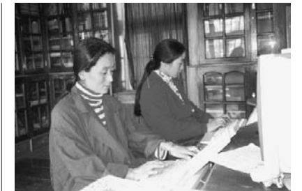
Data Input at ITTM, Kalimpong, 2004