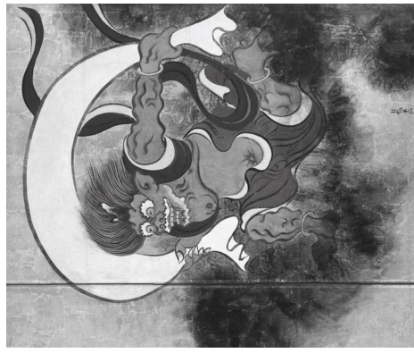
Kunst- und Ausstellungshalle der Bundesrepublik Deutschland GmbH

Bodestrasse 1-3 (Entrance Lustgarten) D- 10178 Berlin-Mitte T +49-30 2090 3254 www.smb.spk-berlin.de/ant.