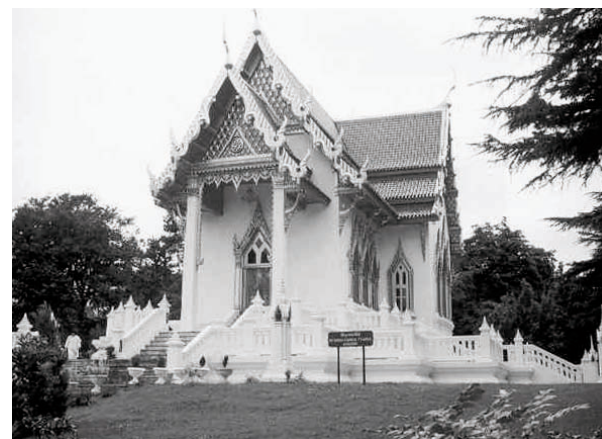
The ubosot at Wat Buddhapadipa, Wimbledon, England.

Museum Mile Bonn Friedrich-Ebert-Allee 4 D-53113 Bonn phone +49 (0) 228. 9171-200 Tue+Wed 10 a.m.-9 p.m. Thu-Sun 10 a.m.-7 p.m. www.bundeskunsthalle.de