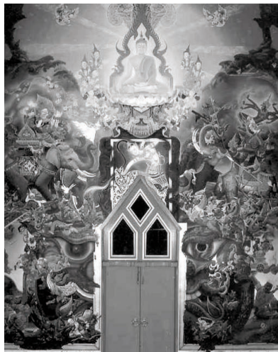
The defeat of Mara and the Enlightenment.

From the records of various interviews Cate has conducted with founding members, supporters, and patrons of the temple, we can glean an idea of its actual functions. These tally, in gen-