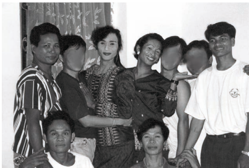
The Cambodian Americans (shown with their faces concealed) pose with their Cambodian 'sisters'. The photo illustrates the various ways in which Cambodian men who adopt the role of the khtəy present themselves. However, the young man on the far right is considered an eligible bachelor and occasionally socializes with the khtəy .

They returned to Cambodia to find family members they hoped had survived the Khmer Rouge purges. They went to meet their khtəy counterparts, the term used in their first language to describe those men (or women) who adopt the dress and comportment of the opposite sex. And, stuffed between the anti-malarial drugs and the Imodium, they packed their American sequin dresses, make-up, wigs, and lingerie to make their debut as 'drag queens' in Cambodia.