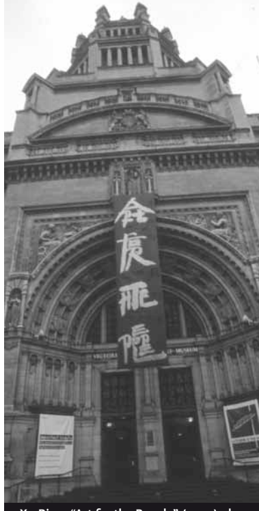
Xu Bing, "Art for the People" (1999), dye on polyester, 1100 x 275 cm.

Through Afghan Eyes: A Culture in Conflict 1987-1995 Featuring the work of Afghan photographers and cameramen, this exhibition will present photography and videos that document the Soviet war